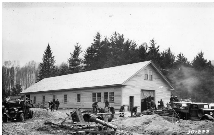
This picture titled "Bartlett Supply Depot at the Saco River CCC Camp"

January 21, 2016 "We Can Do It" The CCC Time: 7:00 p.m. Location: Community Room @ Josiah Bartlett Elementary School